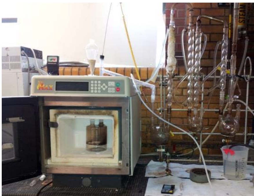
Figure 1-2. Photo of the experimental set up